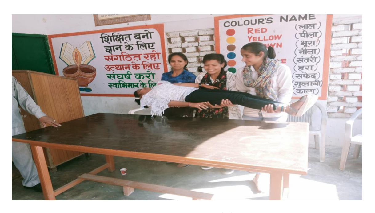
FIRST AID TRAINING BY YRC