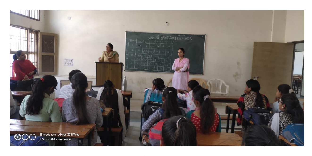
QUIZ COMPETITION BY HINDI DEPARTMENT