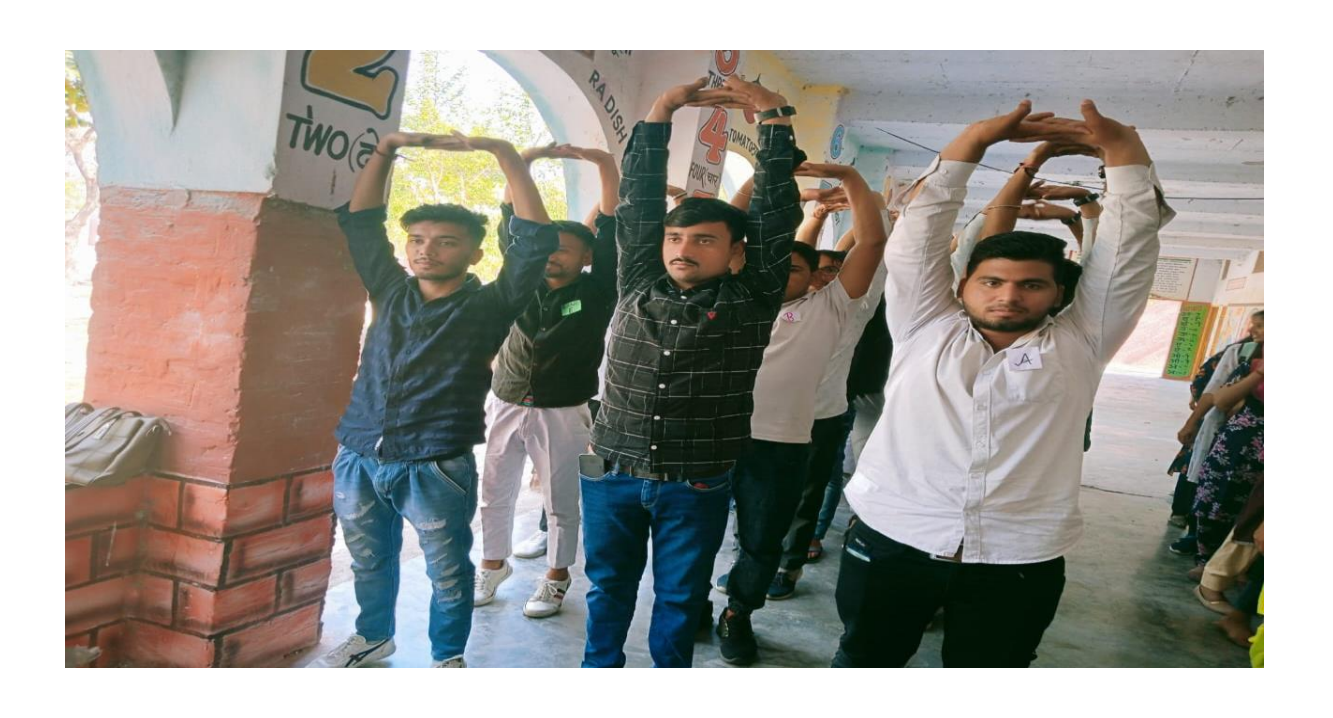
YOGA PRACTISES BY NSS STUDENTS