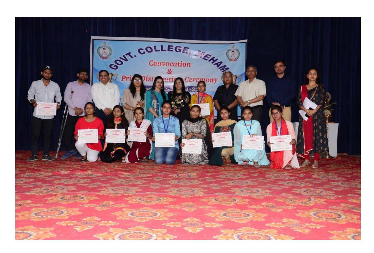
ANNUAL PRIZE DISTRIBUTION FUNCTION