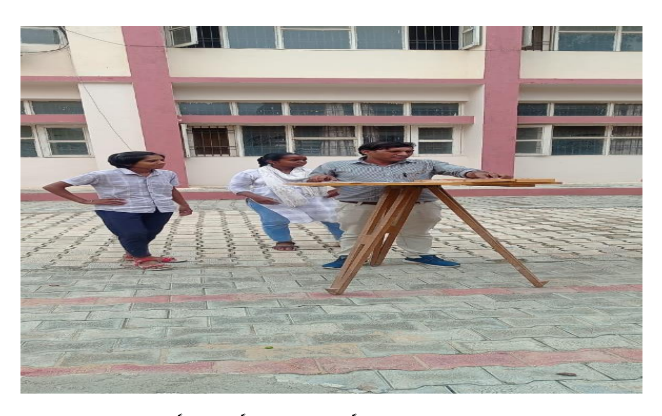
FIELD WORK BY GEOGRAPHY DEPARTMENT