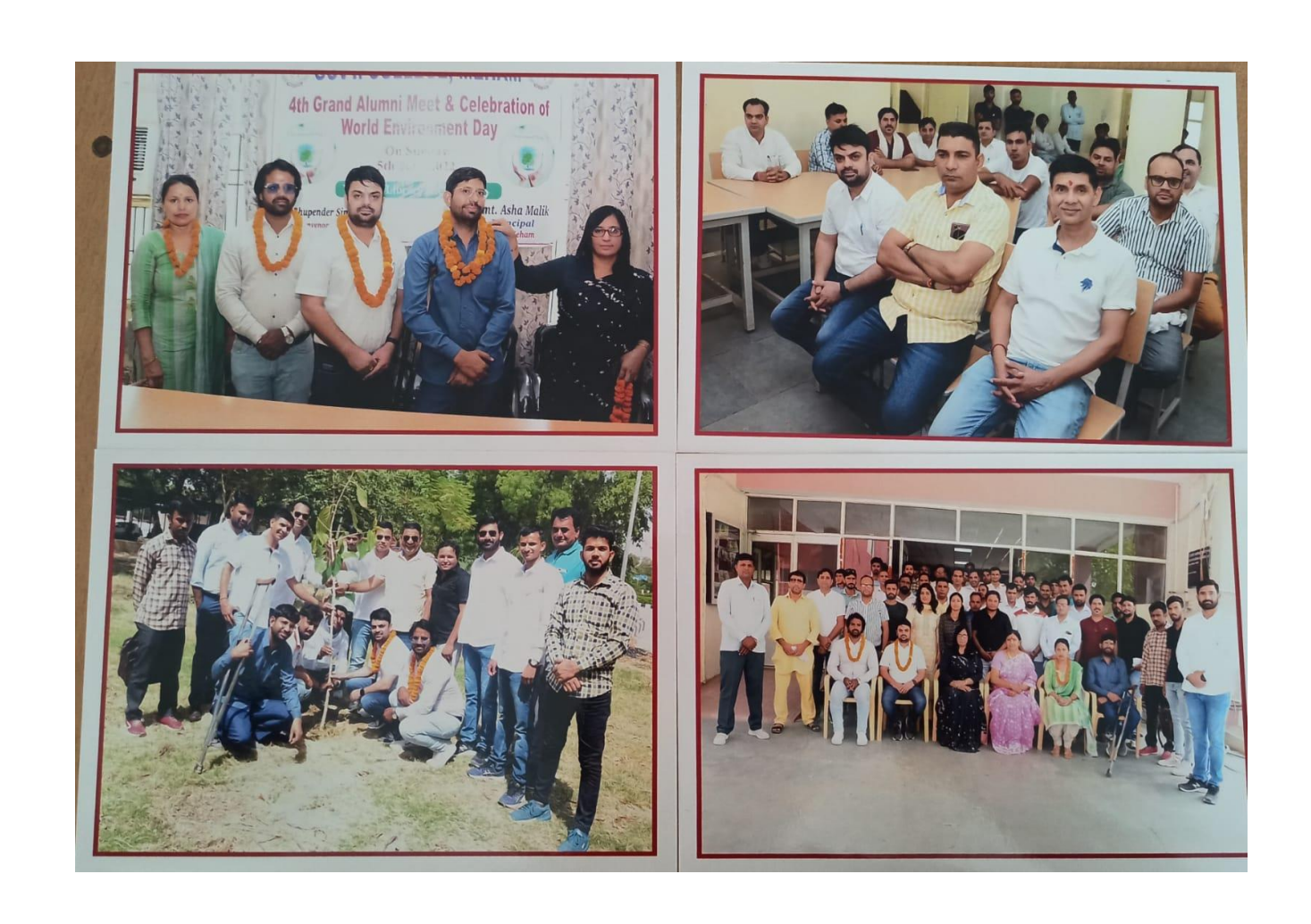
MOTIVATIONAL LECTURE BY ALUMNI PERSONS