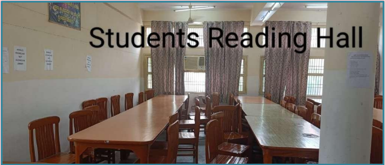
Students Reading Hall