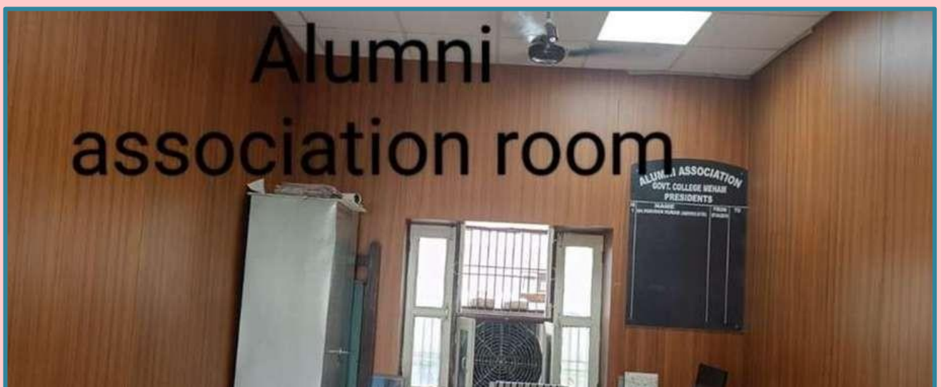
Alumni association room